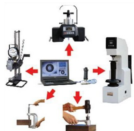
Combination with Brinell Hardness Testers